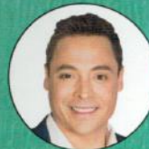
JEFF'S MEATBALL PARMESAN