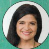
ALEX'S HOMEMADE CANNOLI