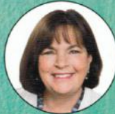
INA'S PASTA SOUP