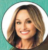
GIADA'S LEMON SPAGHETTI